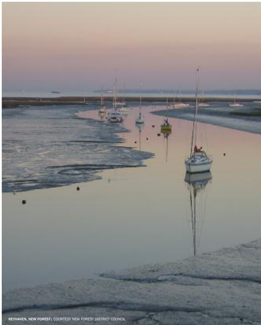
KEYHAVEN, NEW FOREST

The Solent economy is intricately linked to marine activities such as sailing, boat-building, fishing, tourism, heritage sites, recreational sports and leisure. These activities require different types of access and facilities. There are also lots of amenity beaches across the Solent which attract large numbers of visitors each year. The way in which the coastline is managed must be sympathetic to these needs.