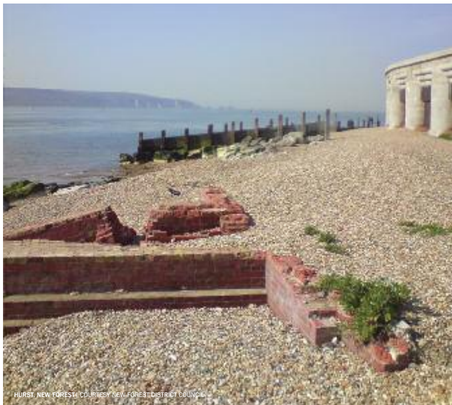
HURST, NEW FOREST

This SMP is built upon the aim of achieving balanced sustainability i.e. it considers people, nature, historic and economic realities. The short-term policies for this SMP provide a high degree of compliance with objectives to protect existing communities against coastal flooding and erosion. The medium-term policy, allows for transition between the short and long-term. The long-term policy promotes greater sustainability for parts of the shoreline and focuses on sustaining and possibly enhancing the natural character of this coast.