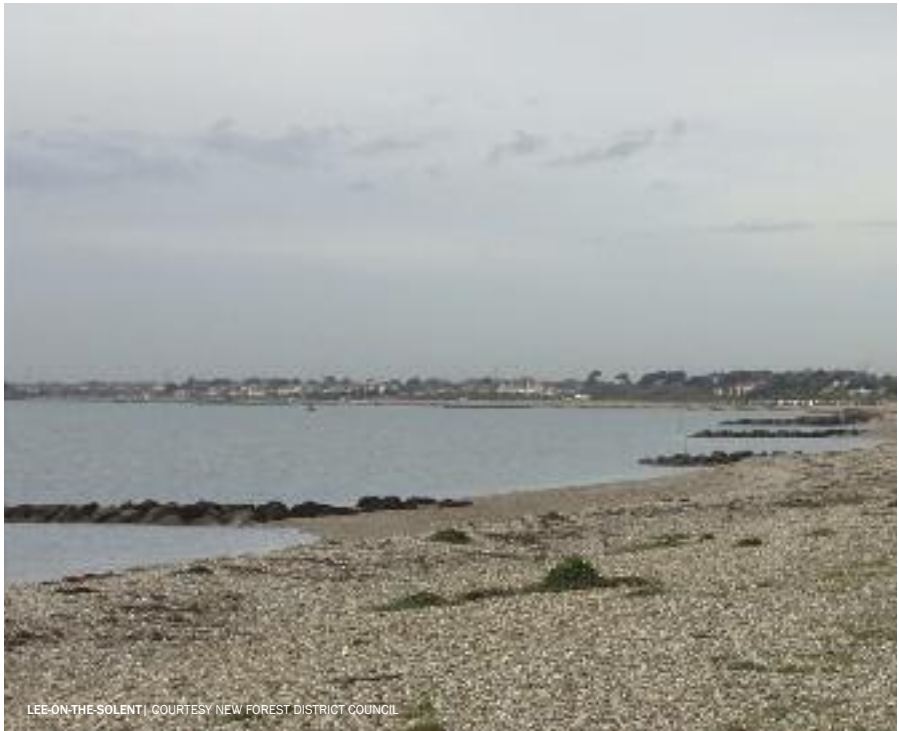
LEE ON THE SOLENT

While the plan provides a framework for future decisions, the implementation of the policy relies on the availability of funding.