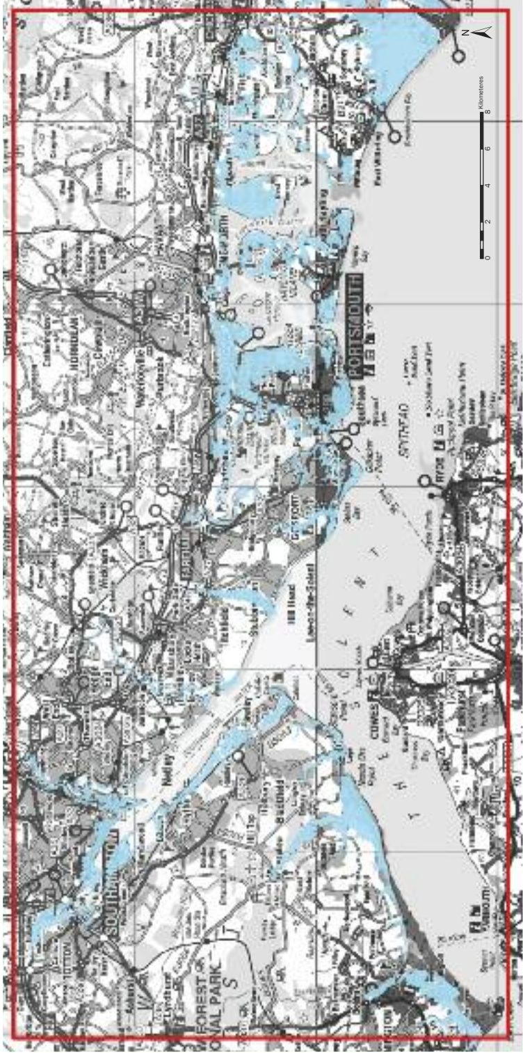
Map showing current tidal flood risk area if no defences were in place. Chance of flooding 1 in 200, in any one year.

Study Area Tidal Flood Risk Area - 2008 (1:200/yr) Floodzone 3 © Environment Agency Channel Coastal Observatory This map is reproduced from Ordnance Survey material with the permission of Ordnance Survey on behalf of the Controller of Her Majesty's Stationery Office © Crown copyright. Unauthorised reproduction infringes Crown copyright and may lead to prosecution or civil proceedings. New Forest District Council licence no. 10006220 2004